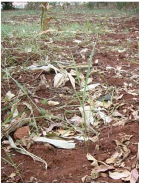
Do not disturb the soil too much..

Conservation agriculture (or minimum tillage) has three basic principles: Maintaining the soil structure through minimum tillage (land preparation), keeping the soil covered as much as possible and practising crop rotation. in the field. The residue is used for The main aim of encouraging conser-